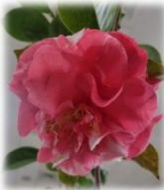
Bart Colbert Variegated