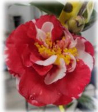
Dixie Knight Supreme